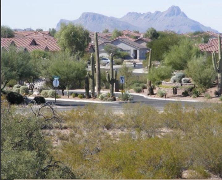
Established Neighborhood Nearby