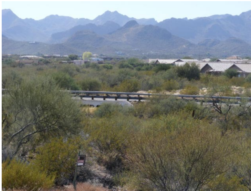
Access is from El Moraga on West Side of Property

Exclusively Represented by: Mick Cluck Tucson Realty & Trust Co. 520.577.7000 or 520.349.3533