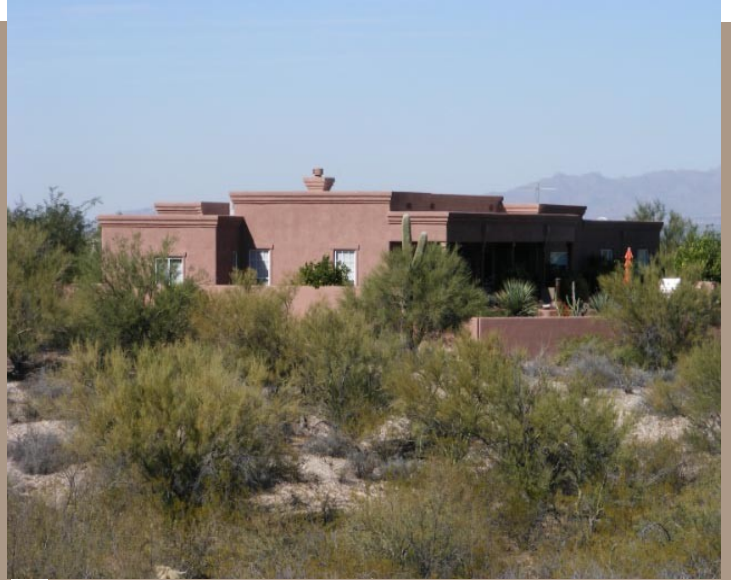
Custom Homes Adjacent to the Site