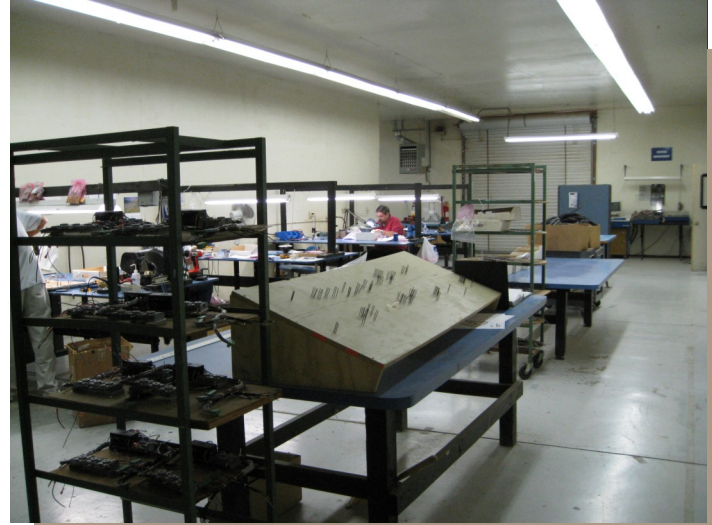
Warehouse / Assembly Area